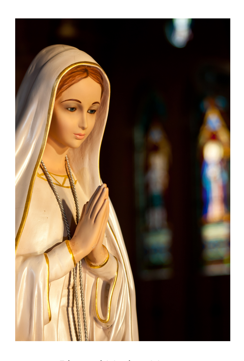
Blessed Mother Mary, Pray for me as I discern which ministry the Lord is calling me to join.